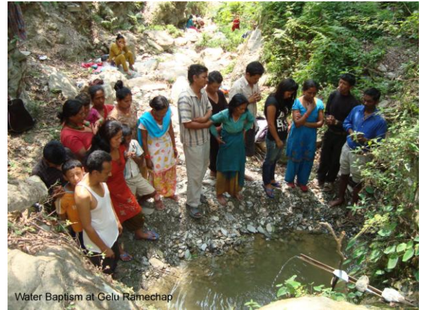
Water Baptism at Gelu Ramechap

not have a chance to watch it again. Then they said, 'this film must be very special'. So we set up the equipment in a public place. The Town Board gave us permission. The local football club also helped us because they knew the Church Boys Football Club. The place was packed; nearly 600 adults came to watch the film. We did not count the children. Many said they had never heard the name of Jesus before.