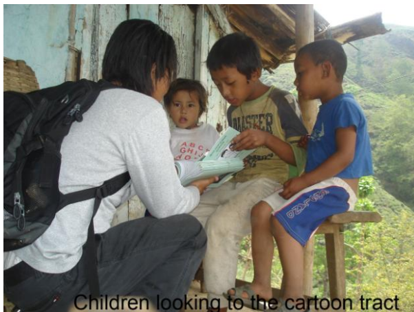
Children looking to the cartoon tract

14 new people committed their lives to Jesus and were baptized in water in Gelu. I know that many people would come to know the Lord