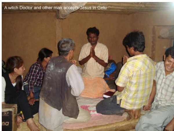
A witch Doctor and other man accepts Jesus in Gelu

We went to the bus stop in Ramechap at 9AM but did not see any buses going out. STRIKE. What to do now? This was a hard decision. We decided to carry the load 12 hours or we would not reach Gelu where people are waiting for us. We carried the loads in heat in the Hiki Piki mountain with no food to eat. We reached our destination at 10PM. We were about to